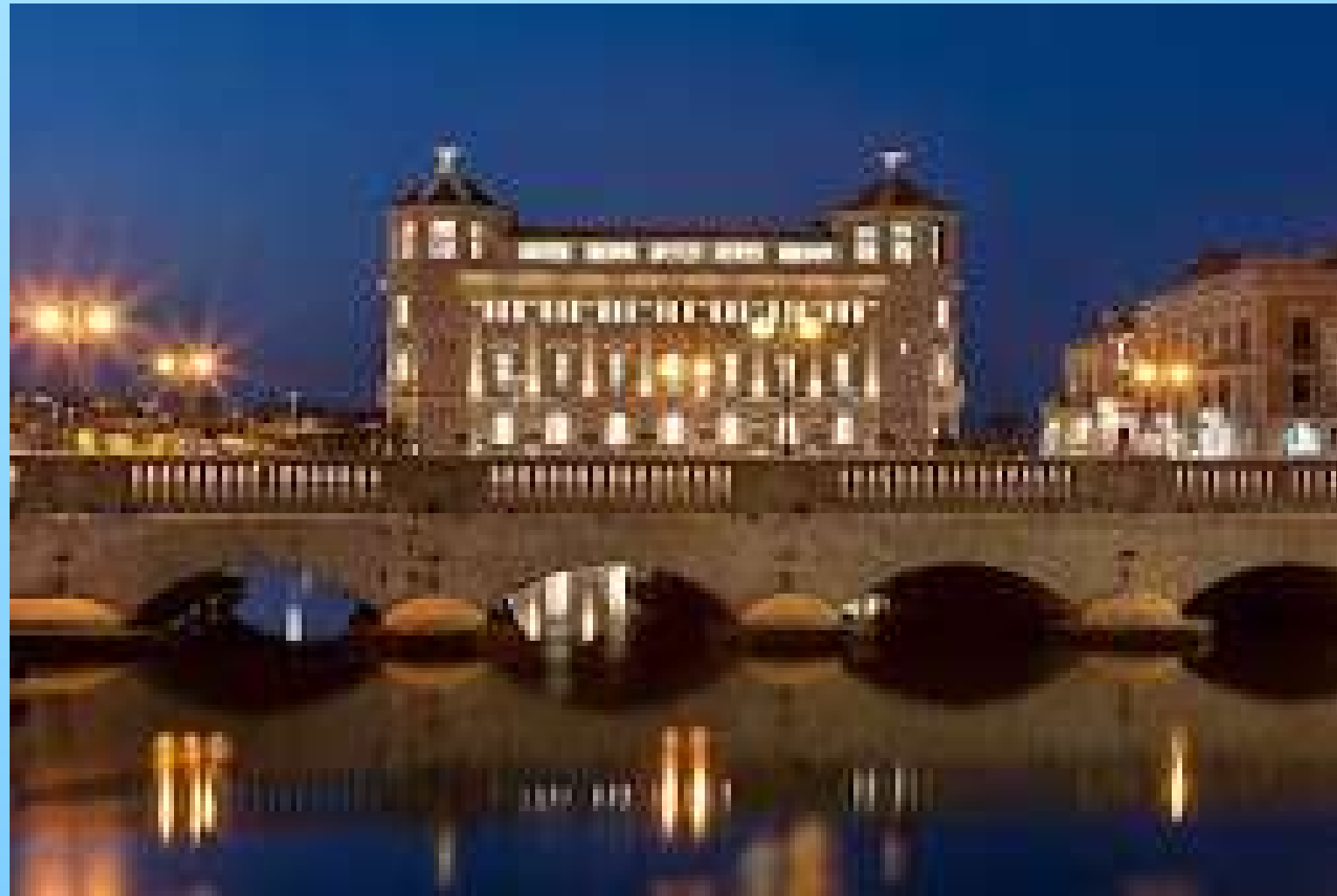
Ortea Luxury Palace Hotel